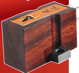
ROSEWOOD SIGNATURE PLATINUM

BODY Rosewood w/Clear Laquer TYPE Moving Coil COIL WIRING Silverplated Copper MAGNET Platinum Magnet CANTILEVER Boron Cantilever OUTPUT VOLTS 0.3 mV FREQUENCY RANGE 20Hz to 100kHz